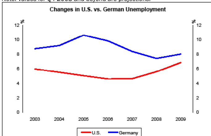
Note: Values for Q4 2008 and beyond are projections.