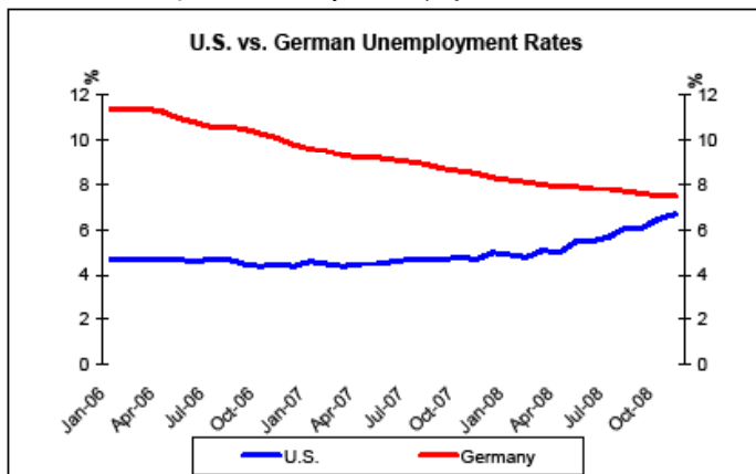
Note: Values for Q4 2008 and beyond are projections.