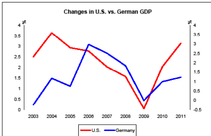
Note: Values for Q4 2008 and beyond are projections.